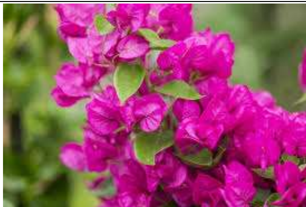
Figure 1: Bougainvillea glabra Linn