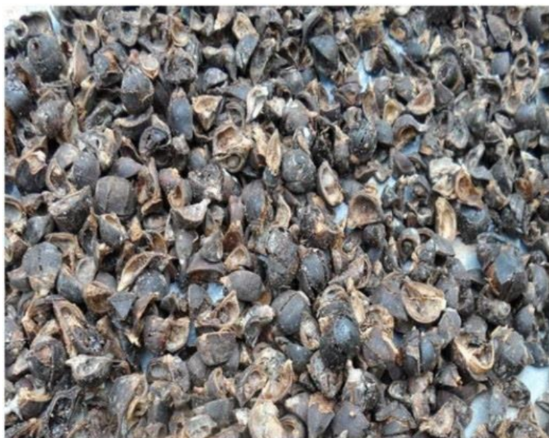
Figure 2: Dried and peeled Azanzagarckeana Magnification: x40

Phytochemicals (from the Greek word phyto, meaning plant) are biologically active, naturally occurring chemical compounds found in plants, which provide health benefits for humans further than those attributed to macronutrients and micronutrients [9]. Plants are able to produce a large number of diverse bioactive compounds. High concentrations of phytochemicals, which may protect against free radical damage, accumulate in fruits and vegetables [10]. Plants containing beneficial phytochemicals may supplement the needs of the human body by acting as natural antioxidants [11]. A knowledge of the chemical constituents of plants is desirable not only for the discovery of therapeutic agents, but also because such information may be of great value in disclosing new sources of economic phytochemicals for the synthesis of complex chemical substances and for discovering the actual significance of folkloric remedies [12]. Hence a thorough validation of the herbal drugs has emerged as a new branch of science emphasizing and prioritizing the standardization of the natural drugs and products because several of the phytochemicals have complementary and overlapping mechanism of action. Mass spectrometry, coupled with chromatographic separations such as Gas chromatography (GC/MS) is normally used for direct analysis of components existing in traditional medicines and medicinal plants.