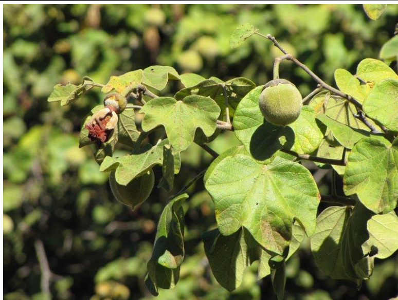
Figure 1: Fresh Azanzagarckeana fruit pulp on its tree Magnification: x40