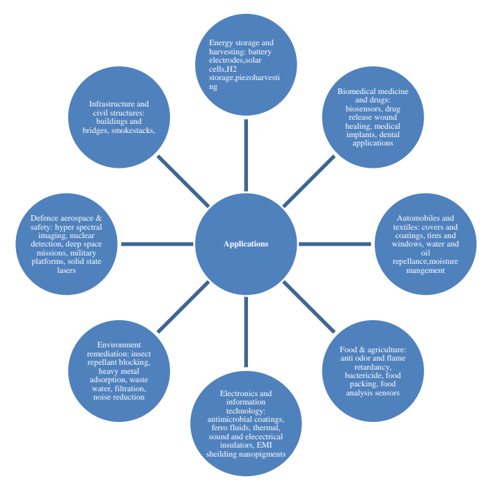
Figure 3. Application of nanocomposites.