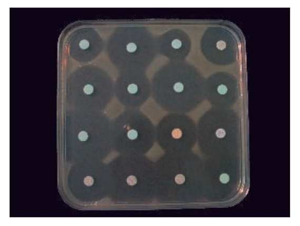
Figure 1:Susceptibility test results of the reference strain E.coli ATCC 25922 regarding16antibiotics (Diffusion technique in agar medium)

Sensitest agar (Oxoid Canada, Nepean, Ontario), which compares well with Mueller-Hinton agar for testing Enterobacteriaceae (Flandrois, Peyret M, Zindel J, 1991). Escherichia coli strain ATCC 25922 (American Type Culture Collection, Manassas, Virginia, USA), which gave reproducible growth inhibition zones, was used as a susceptible control throughout(Feillou,Martel, 1996, Bateman,2000). The results of susceptibility testing are diameters of inhibition zones whose size is inversely proportional to the concentration (MIC) of antibiotic against bacteria (Figure 1).