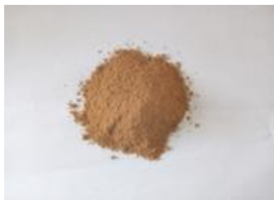
Figure 2: Grounded kolanut

The kola nuts used in this study were obtained from Nsukka, Enugu State, Nigeria. The kola seeds were washed, reduced in size and sun dried for four days. The reduced kola seeds were further grounded using an electric grinder and sun dried again for two days, after which it was manually grinded with a clean and dried mortar and pestle to obtain a powdered form of the kolanut.(Figure 2)