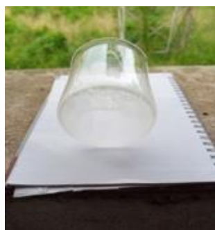
Figure 3: Isolated crude caffeine at the bottom of the beaker. Yield 0.5