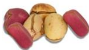
Figure 1: Kola nut