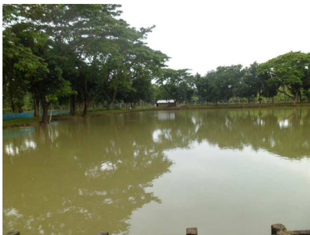
Fig 1: POND WATER

Sample was collected in 250ml glass bottles. The samples were collected for other physiochemical parameters, pre-cleaned by washing with non-ionic detergents, rinsed in tap water. Before sampling, the bottles were rinsed three times with sample water before being filled with the sample. The actual samplings were done midstream by dipping each sample bottle at approximately 20-30 cm below the water surface, projecting the mouth of the container against the flow direction. The samples were then transported in cooler boxes.