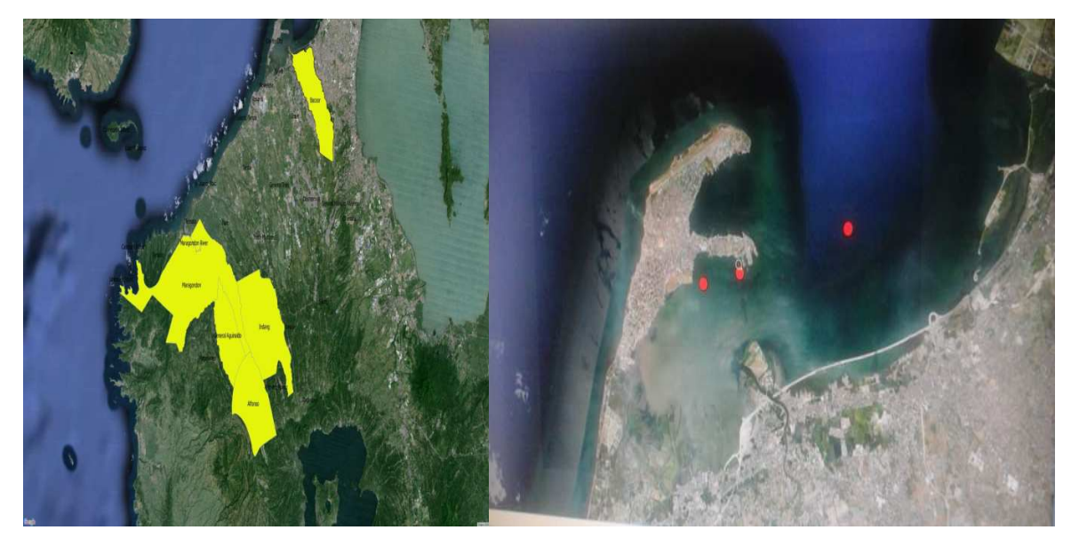
Figures 1 and 2. Sampling sites where water and biological samples were collected

The water samples were collected from the different surface water sources in the upland mountainous area of Cavite specifically the municipalities of Magallanes, Maragondon, Indang, and Alfonso. They are situated at a very high elevation above 400 meters (1,300 ft) with slopes of more than 2%. Biological samples were collected from three (3) sites in Bacoor Bay (Figures 1 and 2) with coordinates 14° 28.581'N and 120°54.413 E for site 1, 14° 28.683' N and 120° 54.975 E for site 2 and 14° 29.076' N and 120° 56.566' E for site 3.